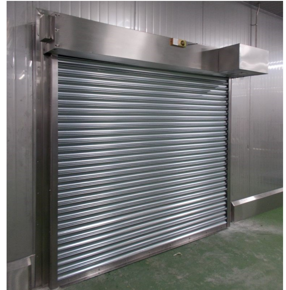
Pictured installation, 75mm convex lath stainless steel with polished stainless enclosures in a food plant.

FIREBRAND Fire Roller shutters are designed and manufactured in the UK By Hart door systems to BS EN 16034 and tested by the BRE/LPCB To BS EN 1634-1. They are also compliant and tested to NFP80 American standard, by UL in Chicago.