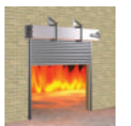
Fire Shutter to UK or US Standards