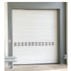
Roller Shutters Fire and/or Security