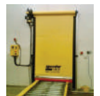
Automatic Conveyor Door