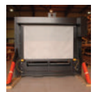
High Speed Fire Resistant Conveyor