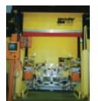
Machine Guard Automated