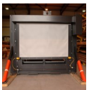
High Speed Fire Resistant Conveyor