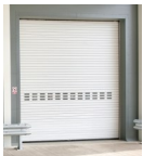
Roller Shutters Fire and/or Security