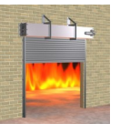
Fire Shutter to UK or US Standards