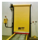
Automatic Conveyor Door