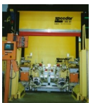
Machine Guard Automated